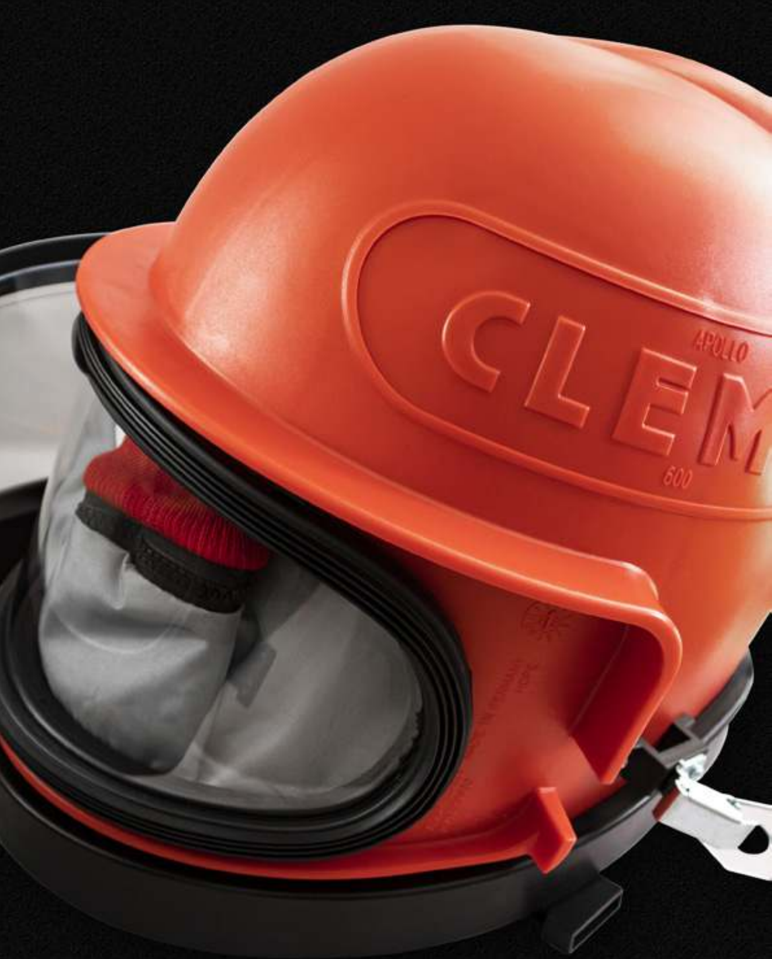
Apollo 600 Helmet