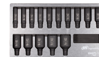
DXSK2M15L - DXS2™ Drive Deep Metric Impact Socket Set, 15-Piece