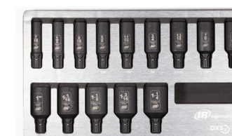
DXSK2H14L - DXS2™ Drive Hex Deep SAE (Imperial) Impact Socket Set, 14-Piece