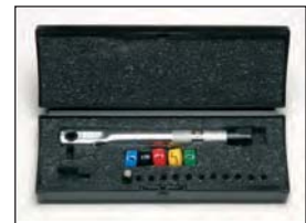
Model 5 'P' Type

Coloured end seals are provided to identify the wrench to a particular operator, torque setting or calibration period.